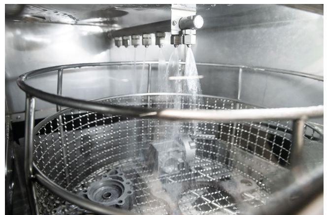
Cleaning process in an industrial washing machine

PETROFER developed a neutral cleaner in the FEROCLEAN N series for the automotive industry. The product cleans engine parts such as crankcases and cylinder heads without staining, and is used at high pressure while cold. This cleaner has been introduced as a worldwide group standard of a leading automotive manufacturer.