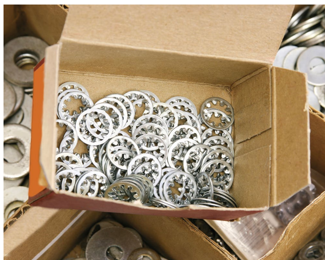
Parts protected with water soluble rust preventive ready for packaging